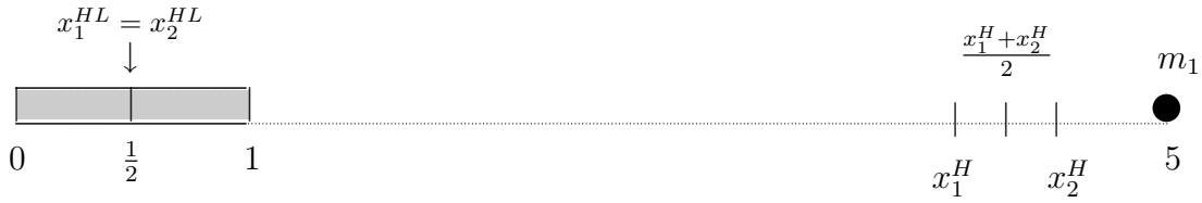
Figure 2: The Weber point and the locations of Hotelling's firms